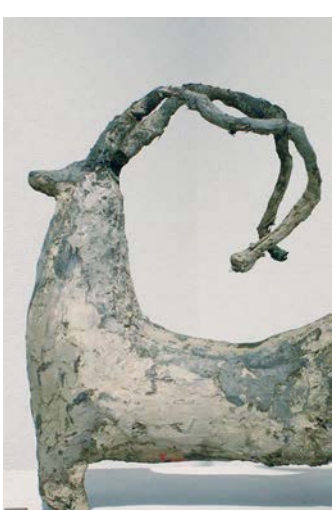
dear 2016 Taro Mizushima