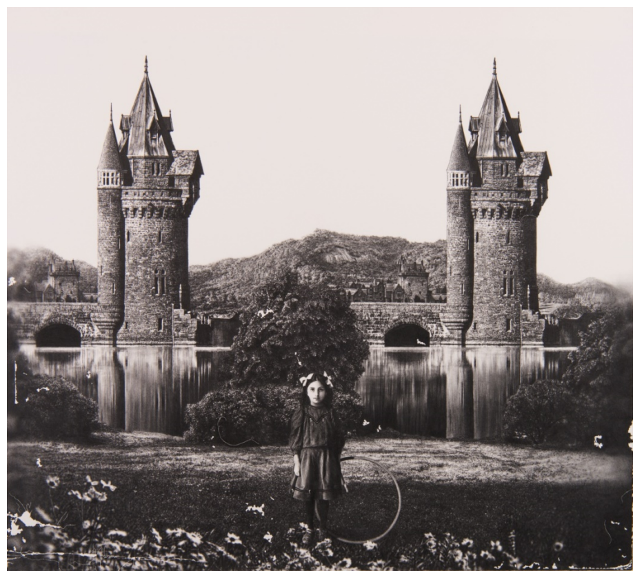
Rondo5, 2017, pensil on paper, 110.0 × 150.0cm

"Rondo 5" by pencil on paper and oil paintings based on ukiyo-e are also on exhibition. We will understand the pluralistic nature of the world through his works and rethink the existence of the world. We are looking forward to your visit.