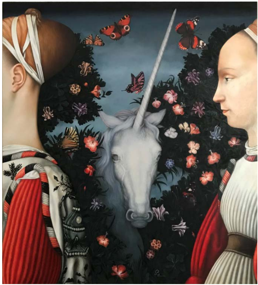
Princess of the House of Este and a Unicorn, 2018, oil on canvas, 55.0 × 50.0cm